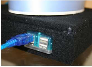
Figure 4. Location base with USB hub.

Second, when a person places an appliance atop or nearby the base (Fig. 1c), the base recognizes that appliance type by reading that appliance's built-in RFID tag (Figure 3, bottom right).