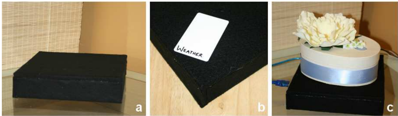
Figure 1. A smart location base, using an information card to assign a data stream to a location, and an appliance placed on a base.