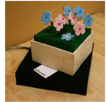
Figure 5. The appliance, base and identifying data stream tag.

In summary, our design strategy and actual implementation reveals that we can build location-dependent information appliances today, and that their infrastructure need not be overly complex. While our current implementation is wired, wireless and battery-powered systems can be realistically built at modest cost if they are mass produced.