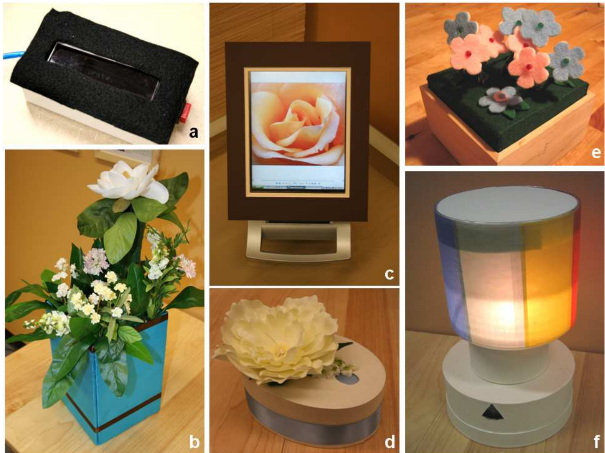
Figure 2. Six Location-Dependent Information Appliances

band trip. The parents want to stay in touch with her via Instant Messaging (IM). They move the FlowerBud appliance to the living room, next to Jane's photo on the fireplace mantle. This location has been configured to show Jane's IM online status, and moving the appliance there causes FlowerBud to light up when Jane is online. Similar to what they did before, the parents do this using an IM information card that they had previously set to Jane's IM contact address.