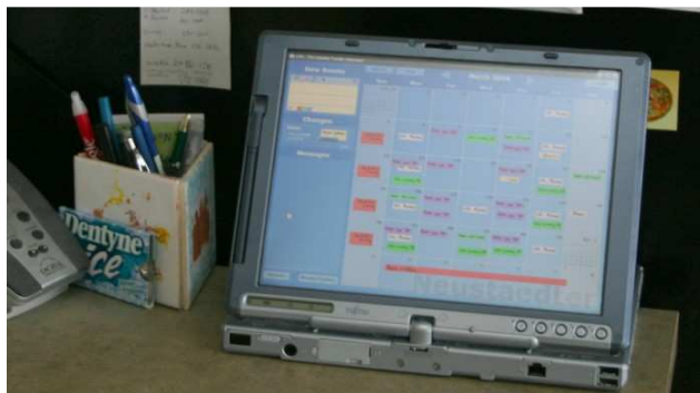
Figure 1. LINC in a family's kitchen.

Technology offers promise for family calendaring. Via networking, digital calendars can make calendaring information ubiquitous and simultaneously accessible from a variety of locations. This lets families more easily view, coordinate and update their activities and events. The challenge is that we cannot simply migrate digital calendars from work into the home [3]. Family coordination is focused on gathering awareness of the family's activities which then enables family members to coordinate [3]. This contrasts with workplace practices where coordination is done by sending meeting invites which assign people to events. Thus, families need a digital calendar that can provide them with easy awareness of the entire family's activities