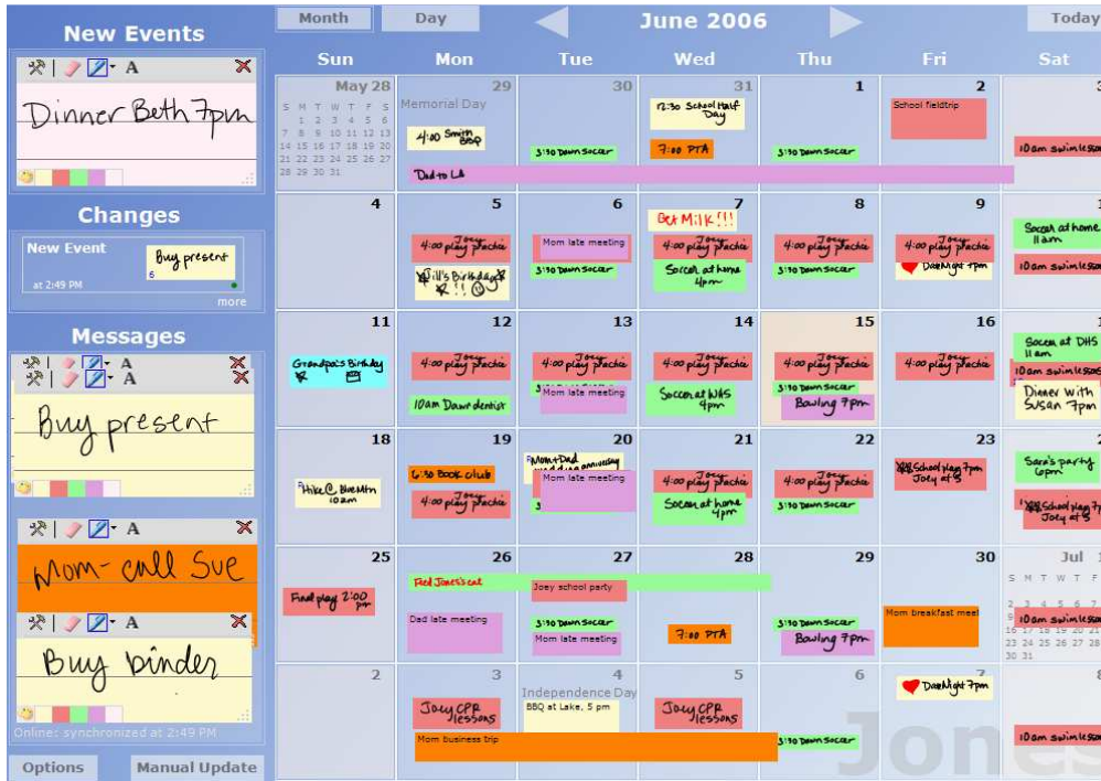
Figure 2. LINC on a Tablet PC showing a sample family's calendar.