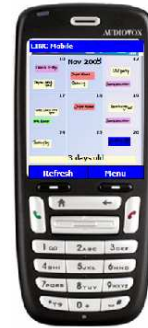
Figure 3. LINC Web and LINC Mobile.