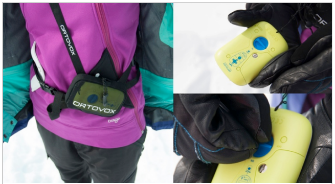
Figure 3. The beacon is worn on the torso in a harness. Some functions and buttons are challenging to use with gloves.

"It is hard to pick up on someone else's signal. The person who found the first victim has already an idea of how the signals are present in the scene and should be the one