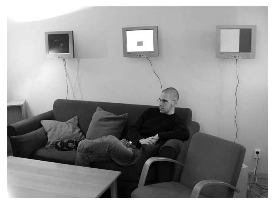
Fig. 1. Three pieces of informative art.

allow for a smooth integration of digital information and physical space, taking advantage of human peripheral attention. For instance, a number of novel information displays that aim to reduce cognitive load and give users more background access to information have been developed [10–12].