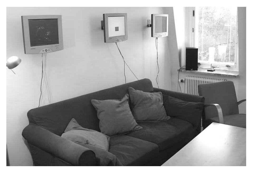
Fig. 3. Three pieces of informative art. From left to right: WebAware [29], and two abstract clocks [28].

We have experimented with displaying time structures in terms of various "clocks", for example a clock inspired by Klein's monochromes, where colours and time structures interpret certain properties of given information and a clock slowly displays time in terms of small changes in colour of a simple geometrical