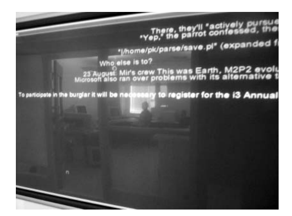
Fig. 6. The ChatterBox.

We have also created informative art that uses slightly more complex sources of information, like the ChatterBox [32] (Fig. 6). The Chatter-Box continuously "listens" for the emails and electronic documents that are sent around an office, for example (privacy issues naturally restricting the extent and nature of this "overhearing"). It then analyses the material and stores the sentences and information about syntax in a database. In parallel, the ChatterBox