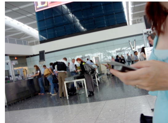
Figure 2. A participant playing Blowtooth in the London Heathrow Terminal 5 security area.

devices is made other than to discover its unique, anonymous and factory allocated hardware address. In addition, the "patsies" or drug mules are never made aware that they were involved in the game. While the technology required to play this game is not novel or innovative, we feel that the combination of the drug smuggling narrative, the task of finding previously tagged passengers and the high security airport environment should produce a unique and engaging experience for players.